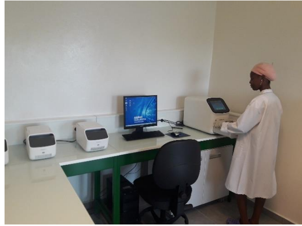
Interior view of the newly inaugurated wildlife genetics lab in Libreville, Gabon